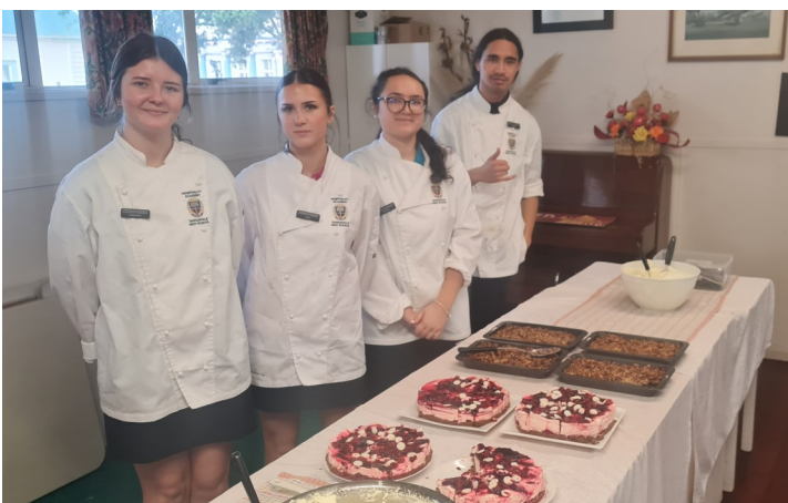
Students from the Hospitality Academy catered for the RSA Ladies Lunch on Monday 22nd July

Dargaville High School Board of Trustees are currently reviewing school policies.